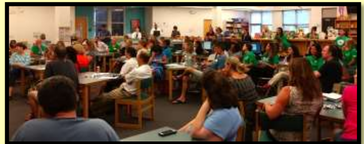
The BAC Meeting last Wednesday evening welcomed a sea of Leesville green seeking greater clarity with the process and timeline for the Pleasant Grove reassignment plan for the 2016-17 school year.

However, the parent representation from Leesville Elementary School managed to remain level, absorb the information, and pose thoughtful questions to advocate for the anticipated impact on the Leesville community. What was learned at this event is that the